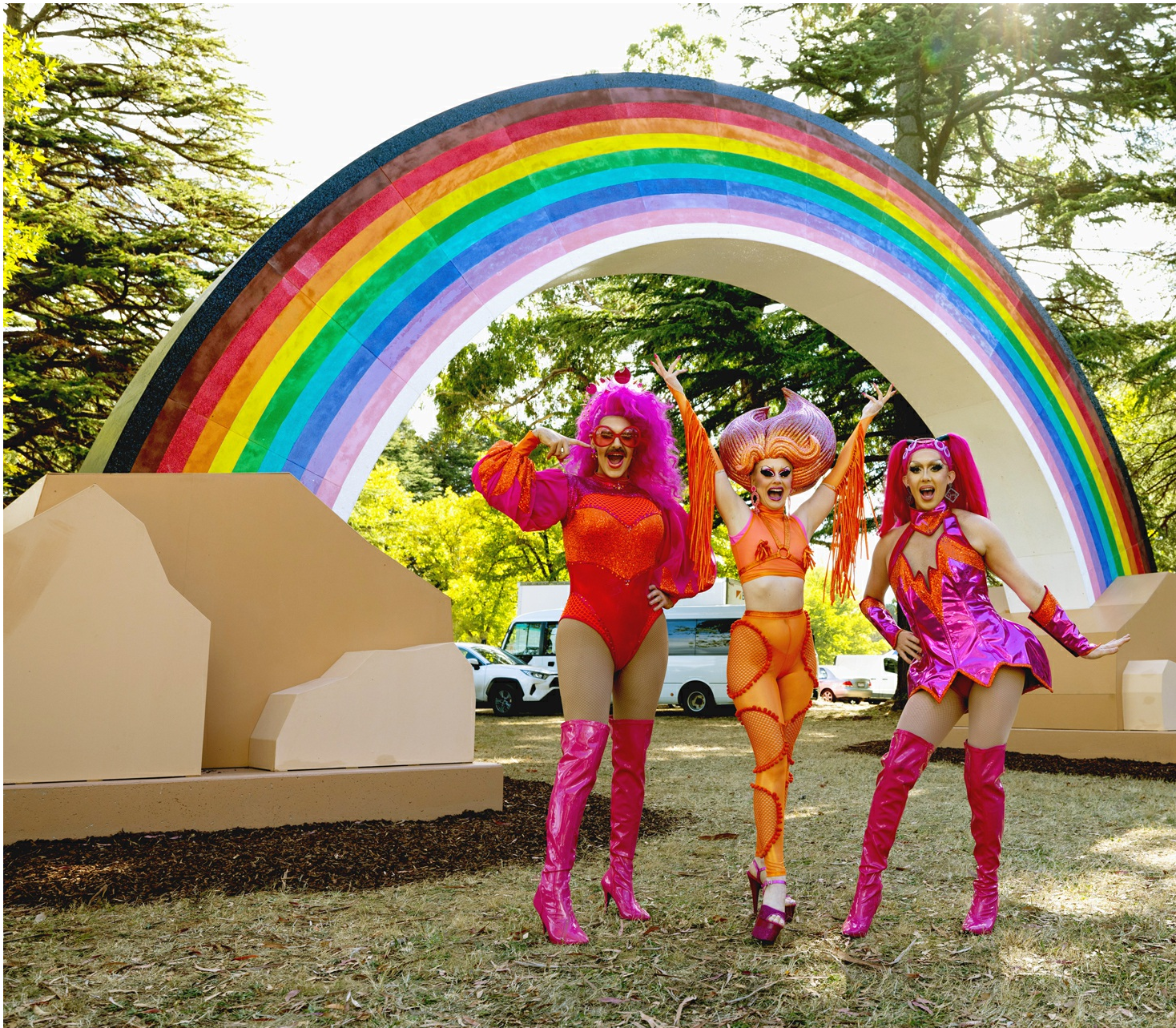
The Big Rainbow in Victoria Park with Tinder Glambassadors

Australia's first "Big" landmark dedicated to regional LGBTQIA+ unveiled in Victoria Park Daylesford